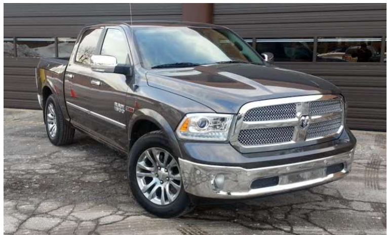
NOT ACTUAL VEHICLE