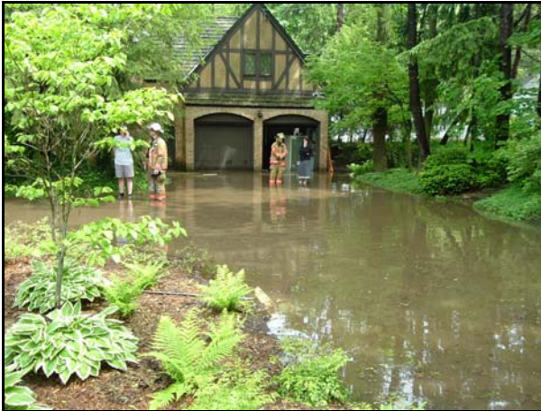
Flooding Upstream of Lakeside Drive

The Waters Drain is a 5 foot wide drainage channel which runs approximately 500 feet South of Fulton Street from Westboro Lake to the Dominican Sisters property at Marywood. It was constructed in 1903 and its purpose is to convey stormwater (rainfall and snowmelt) from an 820-acre (1.3 square mile) watershed into the Grand Rapids storm sewer system. Over the last 100 years, part of the drain has been enclosed in concrete pipe, but most of the drain is an open stream of the same size and in the same location as originally built. Since the 1970s, major storm events have caused flooding in the area West of Lakeside Drive and have flooded the basements of several residences. After severe floods in 2004 and 2006, residents of the affected area petitioned the Drain Commissioner to improve the drain and provide relief from this flooding.