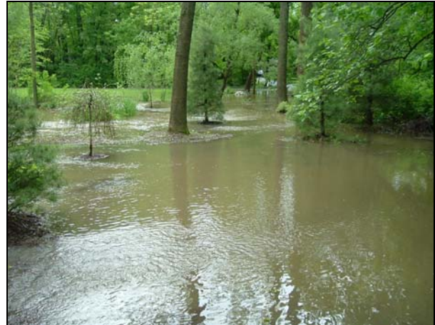
Flooding Upstream of Sunnybrook Avenue

In January 2008, a public hearing was held where an independent Board of Determination took two hours of testimony from residents of the district and found that improvements were necessary to protect public safety, health, and welfare. Since that meeting, the Office of the Drain Commissioner, along with Spicer Group, Inc. of St. Johns, MI, studied the entire watershed and considered a wide range of solutions. The optimal solution requires increasing the size of several culverts including Lakeside Drive, 4 residential driveways, and a 360-foot long culvert under Fulton Street near the Marywood property. In addition to these improvements, it is necessary to construct an embankment near Mayfair Drive to prevent flooding of properties downstream. Over the last 6 months, our consultant and staff have been preparing design plans and acquiring easements for this new construction. On June 1, 2009, we opened bids for this project and we hope to begin construction in early July and complete the project by October, 2009.