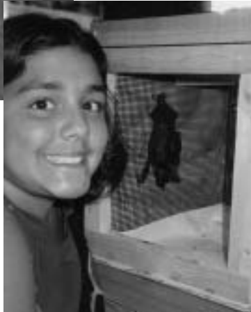
Right: Children can see these strange, sonar guided flying mammals up close.