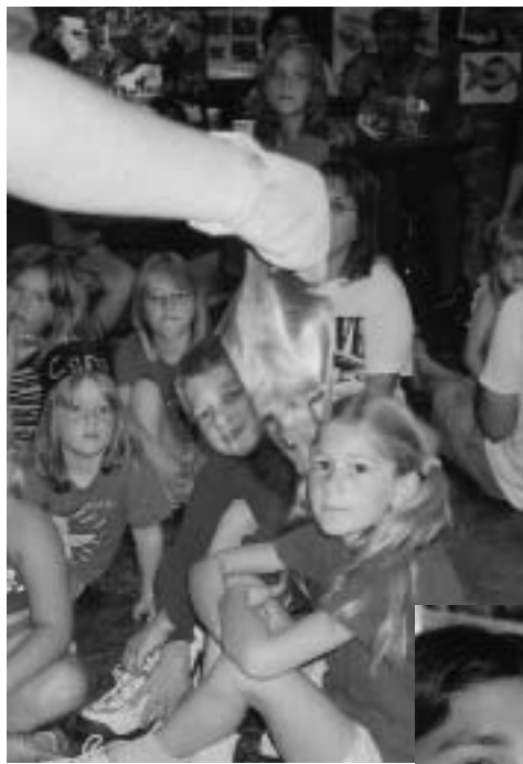
Above: OBC brings several species of live bats, including the African fruit bat, the big brown bat and the vampire bat, to the Nature Cabin.