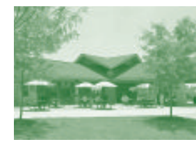
Beach House with Concessions