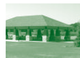
Open Shelter A (reservable)

Reservations for Kent County Park facilities can now be made up to one year in advance. To make a Park reservation, please call our office at (616) 336-PARK, between the office hours of 8:00 a.m. to 4:00 p.m., Monday through Friday. You can may also make your Park reservation by using a credit card, at www.accesskent.com .